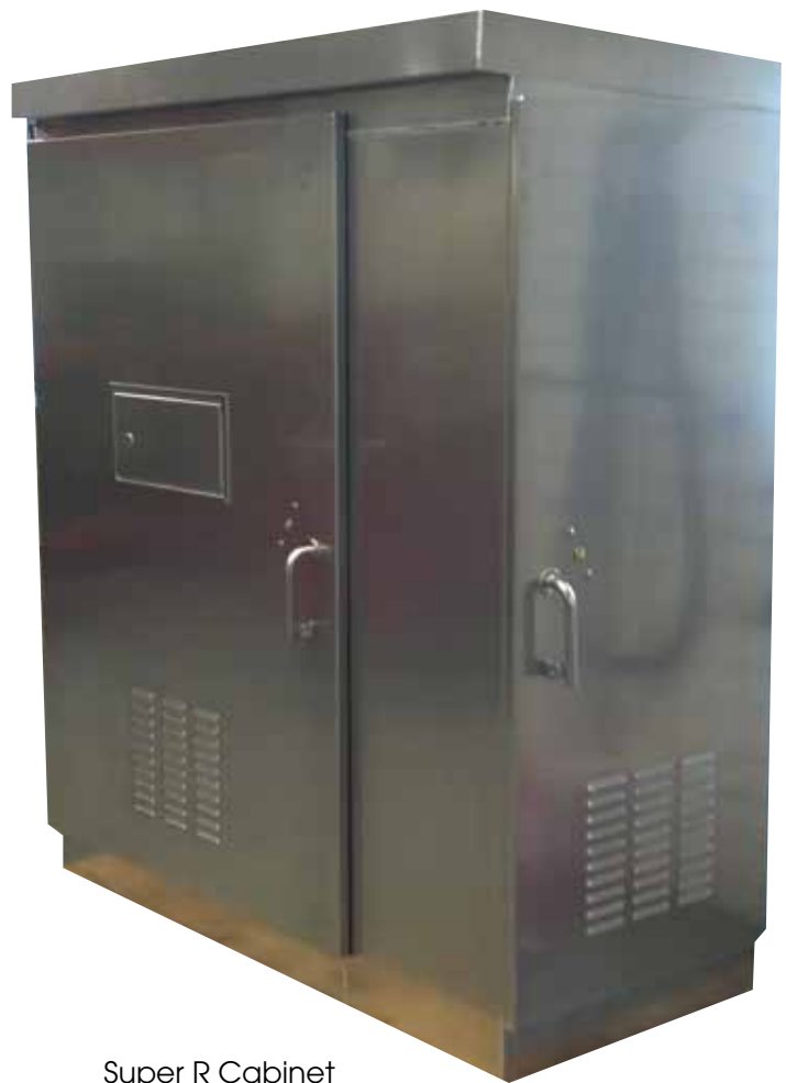
Super R Cabinet

Eagle Traffic Control Systems continues our 80+ year history of providing excellence in the ever evolving traffic industry. All of Eagle's products are developed with the highest standards of engineering and manufacturing. Eagle maintains a superior level of integrity in interactions with all of our business partners and customers. We also take tremendous pride in being model corporate citizens.