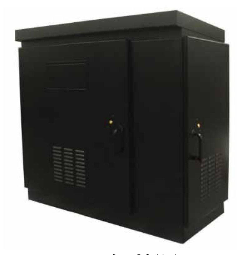
Super P Cabinet (pictured with black finish)

Eagle Traffic Control Systems continues our 80+ year history of providing excellence in the ever evolving traffic industry. All of Eagle's products are developed with the highest standards of engineering and manufacturing. Eagle maintains a superior level of integrity in interactions with all of our business partners and customers. We also take tremendous pride in being model corporate citizens.