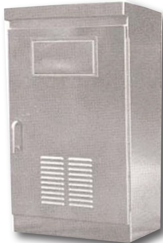
Eagle EL708 Cabinet

Eagle Traffic Control Systems continues our 80+ year history of providing excellence in the ever evolving traffic industry. All of Eagle's products are developed with the highest standards of engineering and manufacturing. Eagle maintains a superior level of integrity in interactions with all of our business partners and customers. We also take tremendous pride in being model corporate citizens.