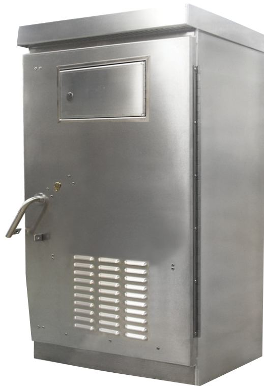
Eagle EL704 Cabinet

Eagle Traffic Control Systems continues our 80+ year history of providing excellence in the ever evolving traffic industry. All of Eagle's products are developed with the highest standards of engineering and manufacturing. Eagle maintains a superior level of integrity in interactions with all of our business partners and customers. We also take tremendous pride in being model corporate citizens.