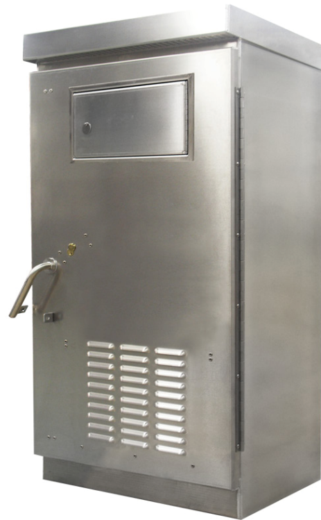
Eagle EL702 Cabinet

Eagle Traffic Control Systems continues our 80+ year history of providing excellence in the ever evolving traffic industry. All of Eagle's products are developed with the highest standards of engineering and manufacturing. Eagle maintains a superior level of integrity in interactions with all of our business partners and customers. We also take tremendous pride in being model corporate citizens.