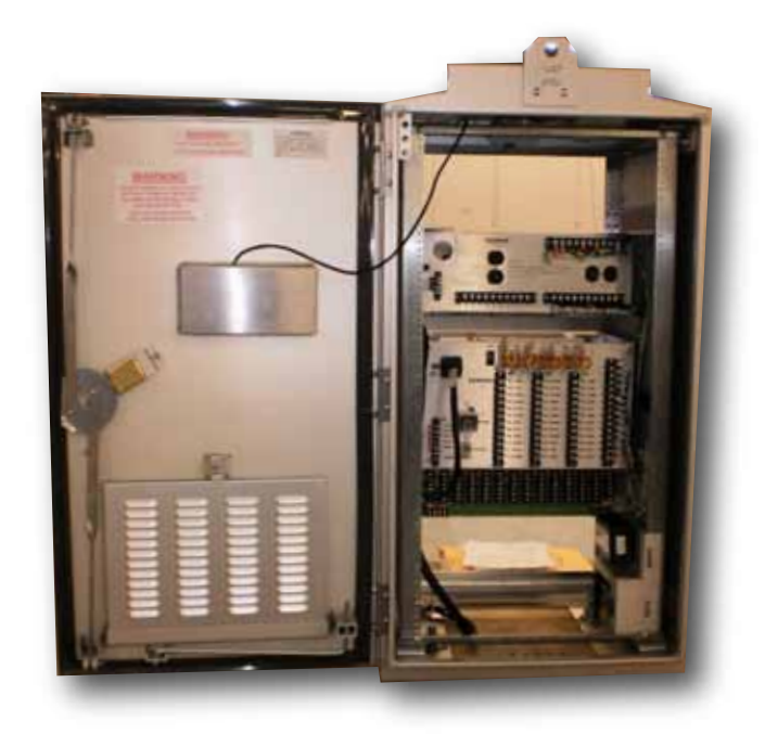
Eagle 336L Cabinet

Eagle Traffic Control Systems continues our 80+ year history of providing excellence in the ever evolving traffic industry. All of Eagle's products are developed with the highest standards of engineering and manufacturing. Eagle maintains a superior level of integrity in interactions with all of our business partners and customers. We also take tremendous pride in being model corporate citizens.