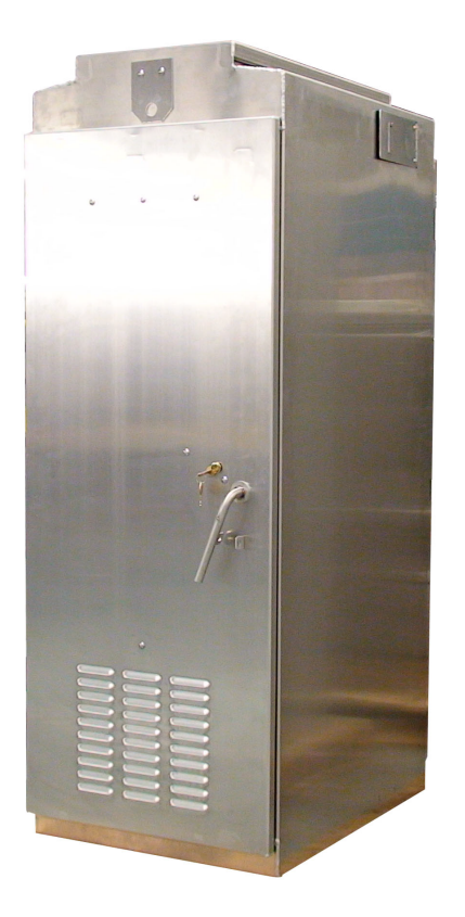
Eagle 334L Cabinet

Eagle Traffic Control Systems continues our 80+ year history of providing excellence in the ever evolving traffic industry. All of Eagle's products are developed with the highest standards of engineering and manufacturing. Eagle maintains a superior level of integrity in interactions with all of our business partners and customers. We also take tremendous pride in being model corporate citizens.